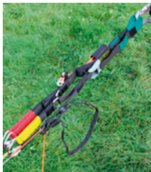
Attachment mountain flying (trimmer hooked into main carabiner)